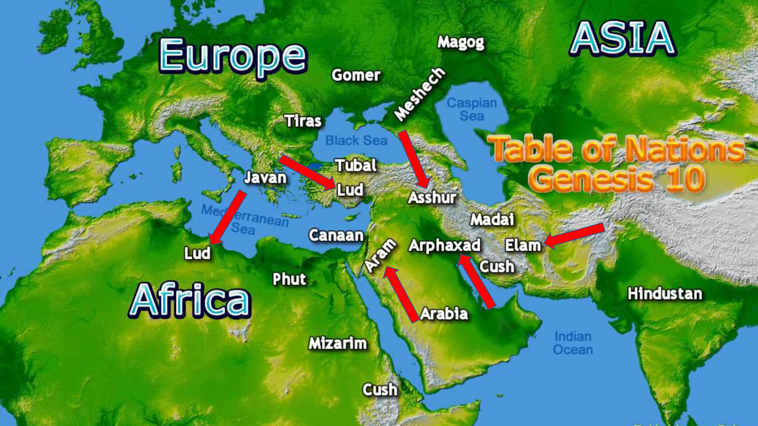
Table of Nations Genesis 10